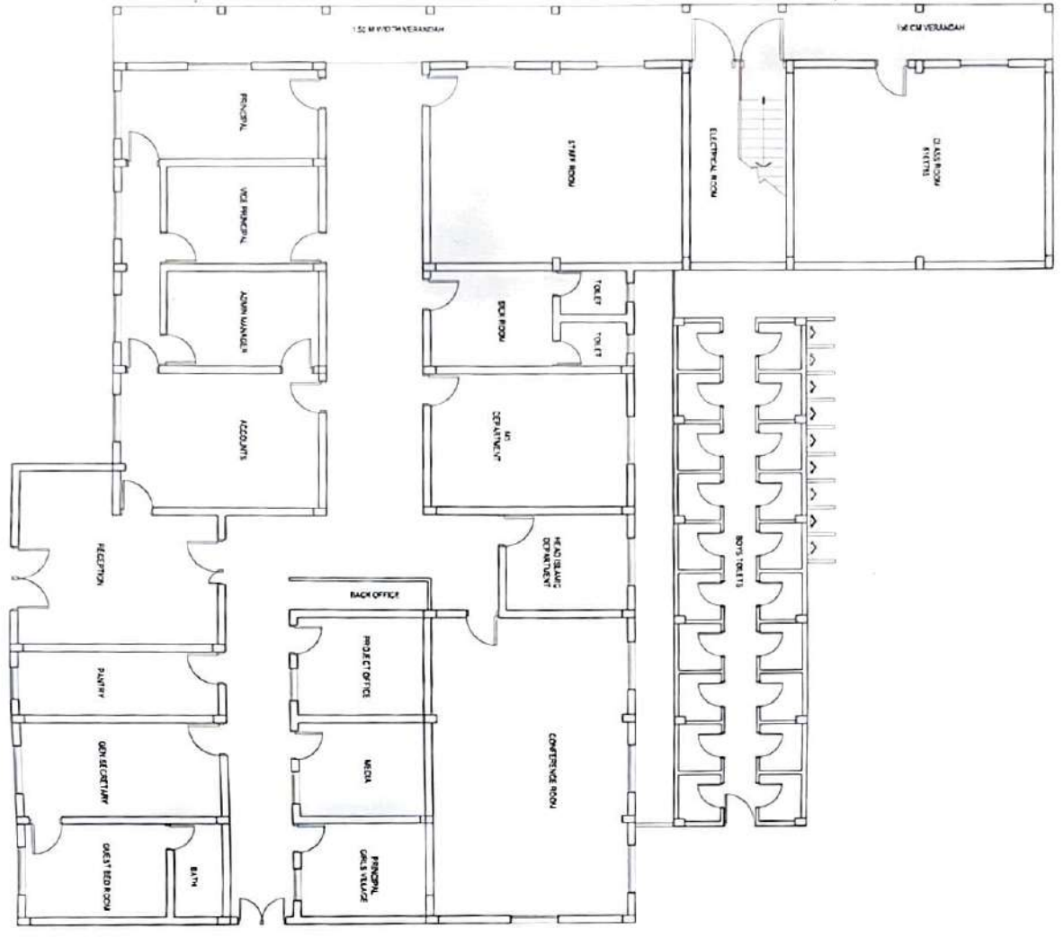
BLOCK -G- GROUND FLOOR PLAN